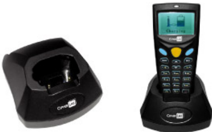
Charging & Communication Cradle