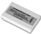
Rechargeable Lithium-ion Battery Pack