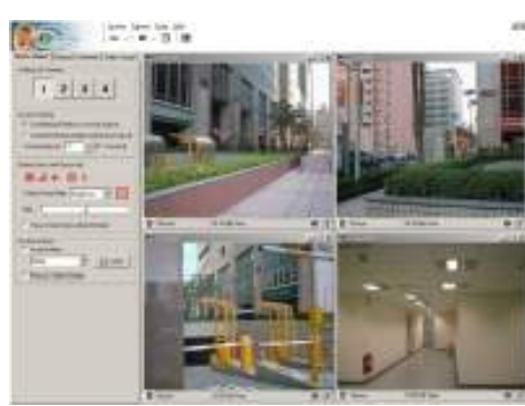
Main Windows - 4 Port