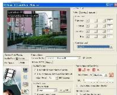
Main Windows - 9,16 Port