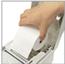
Easy paper loading for paper replacement