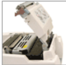
Paper jam and Skew free technology