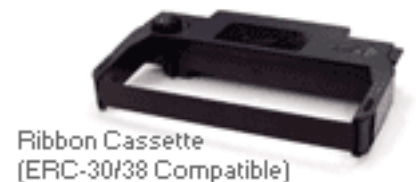
Ribbon Cassette (ERC-30/38 Compatible)