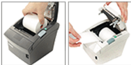
» Easy Paper Loading (Drop and Print)