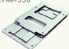
» Wall Mount Bracket