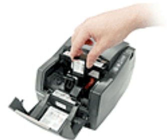
» Easy Ink Replacement