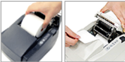
» Easy Paper Loading (Drop and Print)