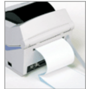
» Rear Side Paper Loading