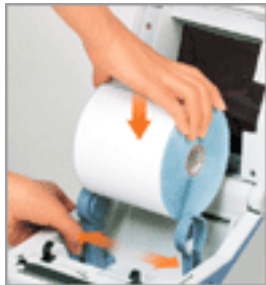
» Paper Loading