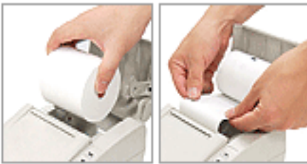
» Auto paper loading for paper replacement