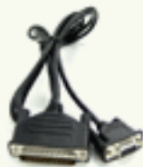
» Parallel Interface Cable