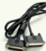
» Serial Interface Cable