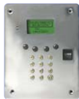
TouchStar Flush Mount