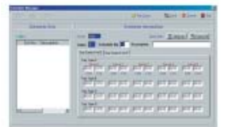
Schedule Management Module