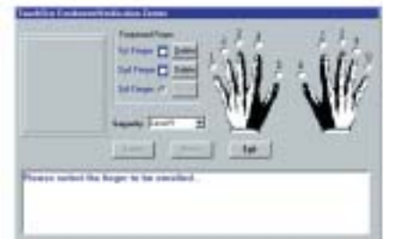
Fingerprint Enrollment Module