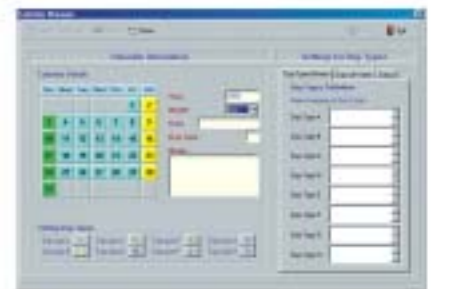
Calendar Management Module